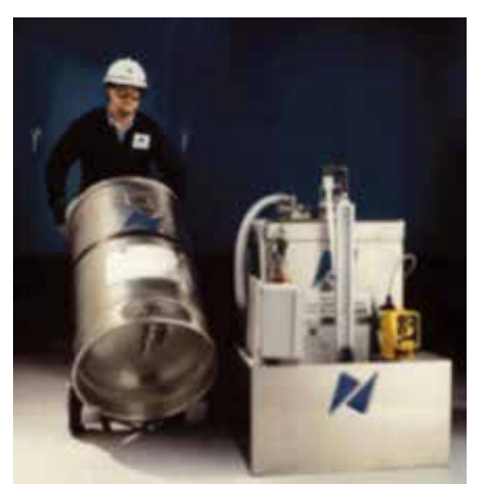
Figure 2 - PORTA-FEED™ Delivery System

The engineers also wanted a more eco-friendly approach to the treatment program. While saving water would meet that need, a request was also made to move to a hands-free chemical delivery and feed system to eliminate drums (Figure 2).